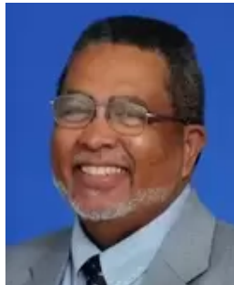
Dr. Adolphus Hailstork